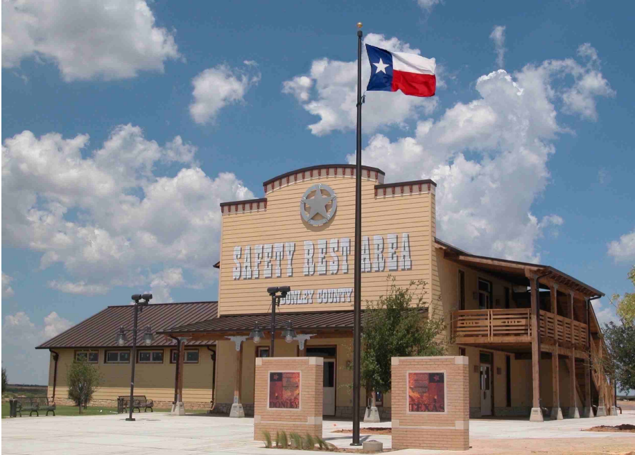
Donley, County Safety Rest Area (Highway 287 near Hedley East of Amarillo)