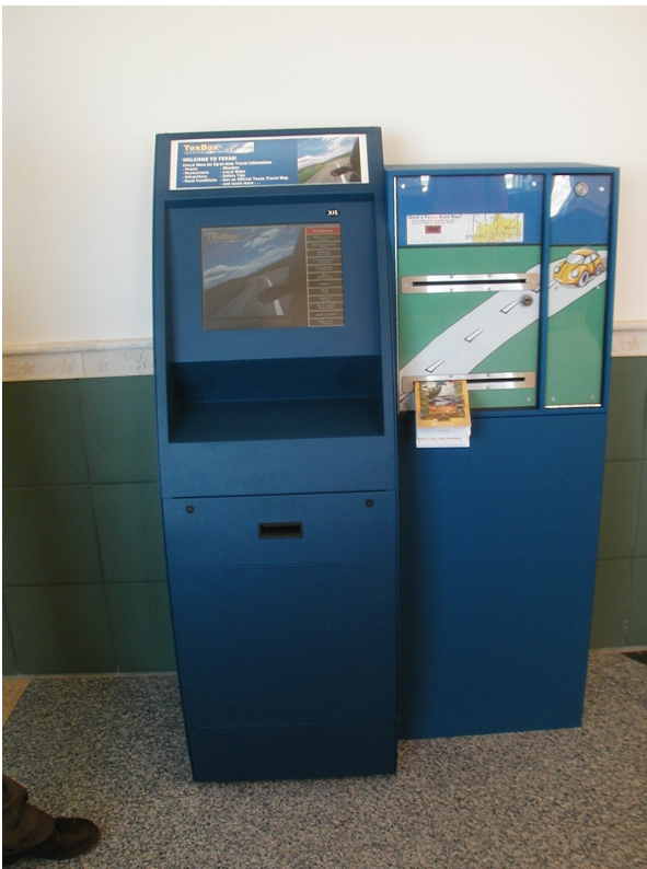
TexBox & Map Dispenser at the Donley, County Safety Rest Area Grand Opening April 3, 2003