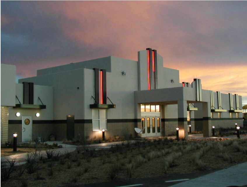
New TxDOT Rest Area on I-40 between Amarillo and Oklahoma state line