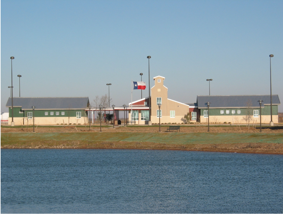
Hardeman, County Safety Rest Area Grand Opening (Highway 287 near Quanah East of Amarillo)